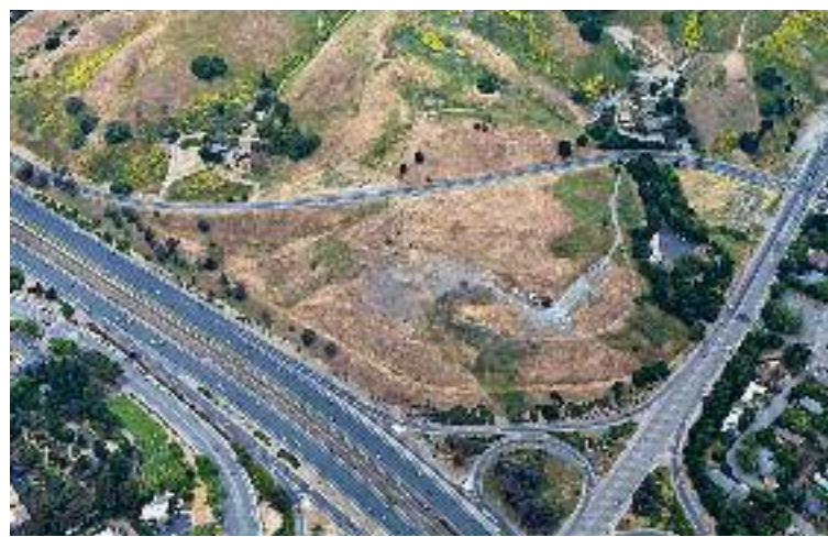
Aerial view of existing The Homes At Deer Hill site

Council members sympathized with parents who had been diligently working on fundraising for improvethe Parks, Trails and Recreation study, concluding the biggest citywide need was an additional sports site are few and far between.