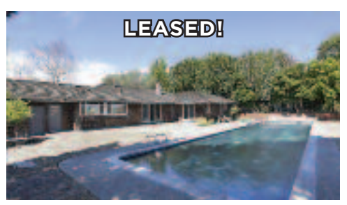
269 Birchwood Drive, Moraga 4 Bedroom, 2 Bathroom, 2060± sq. ft. LEASED FOR $4,500/month

2051 Ascot Drive #202, Moraga Represented the Buyer & Seller SOLD AT $380,000